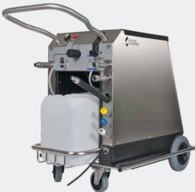
The model illustrated has an extra outlet and a protective frame

Voyager is available in three different sizes with or without a compressor.